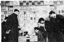
14. 1946: the URSS-USA match